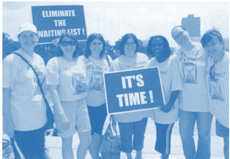
2009 Disabilities Rights Rally

Once on the NOW list, children may be offered the Children's Choice Waiver as an option. This waiver began in February 2001 to offer supplemental support to children with developmental disabilities who currently live at home with their families, or who will leave an institution to return home. There is a cap on the annual amount for this waiver and there is also a waiting list.